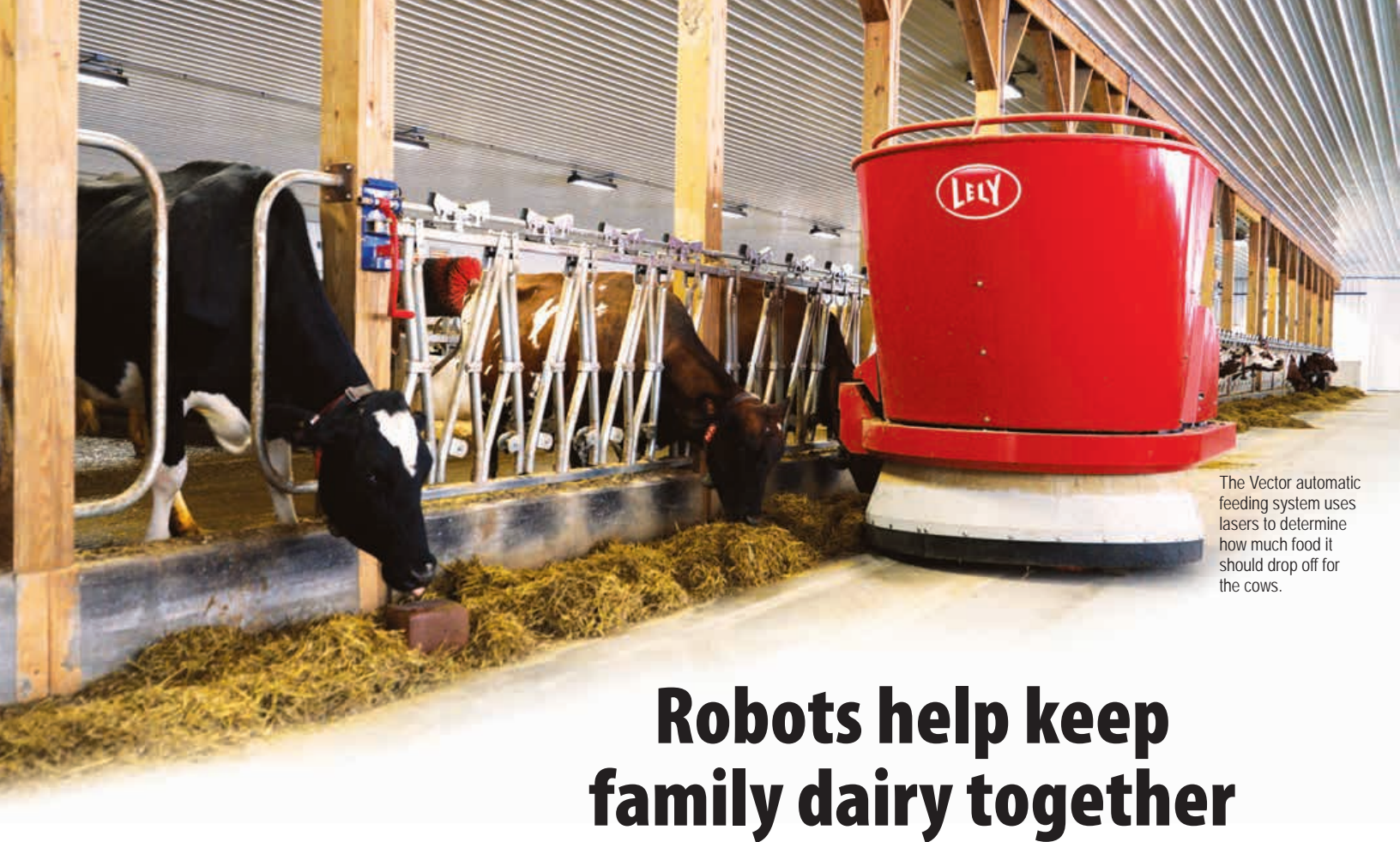
The Vector automatic feeding system uses lasers to determine how much food it should drop off for the cows.